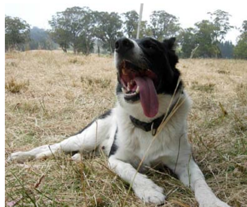
Flash takes a break from set out... but not for long!