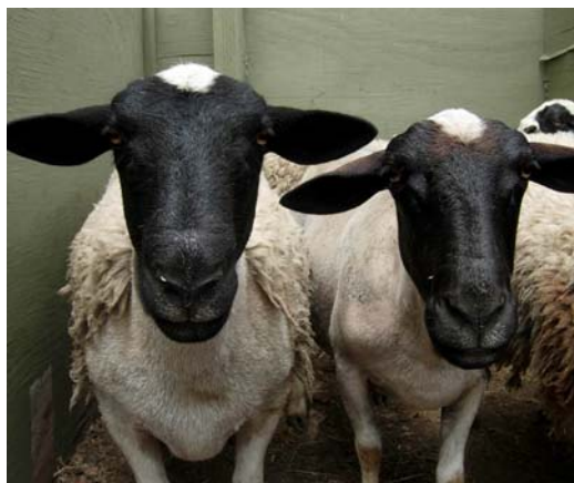
Anyone have a caption for these "Pesky" sheep?