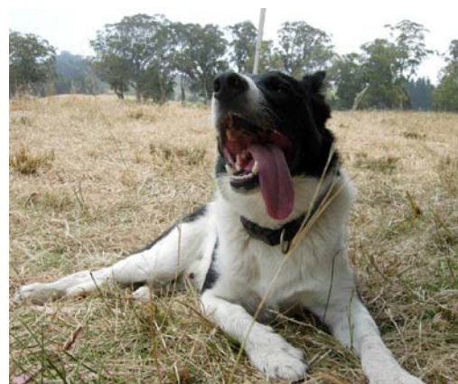
Flash takes a break from set out... but not for long!