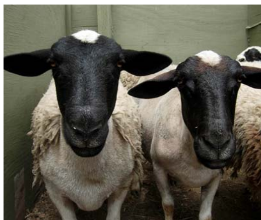
Anyone have a caption for these "Pesky" sheep?